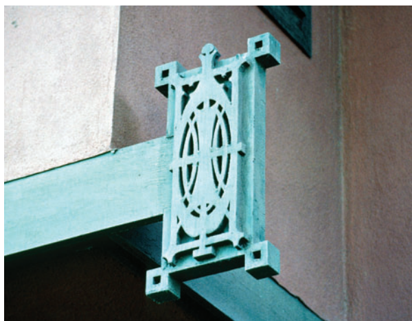
A fret-sawn wood detail on the Hoyt house

In 1995, the Tower View estate became the Anderson Center, the largest artist community in the Upper Midwest. The Anderson Center offers classes, exhibitions, and a residency program for artists. There will be time to tour the estate, visit the world-class permanent art collection, roam the grounds and sculpture garden, and even climb the water tower. Our day will conclude with a reception at Tower View.