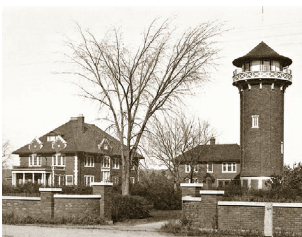
Tower View, now the Anderson Center