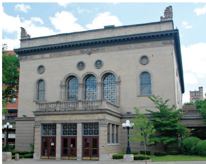
The Sheldon Auditorium