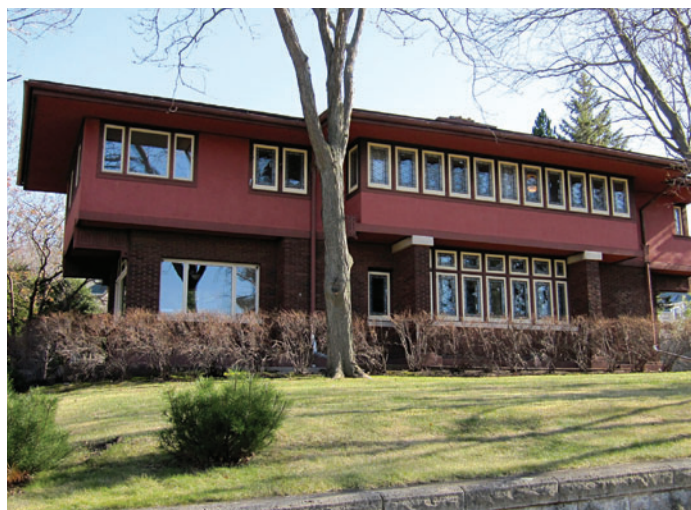
The Hoyt house by Purcell and Elmslie