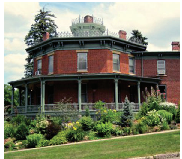
The 1857 Octagon house