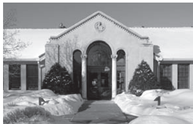
Minnesota Humanities Center, St. Paul, Minnesota (Clarence H. Johnston, 1924)

The March 13 members' meeting brings my three years as board president to an end. As I turn the reins over to our new board president and welcome new members, one point stands out in my thoughts: thank you, members and volunteers, for your support of the MNSAH mission. I look forward to seeing you at future MNSAH events!